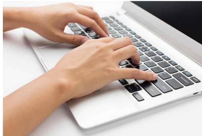
Schreiben der Dissertation / Writing the Thesis

In exceptional cases, the doctoral board shall decide whether the requirement for a cumulative work to be entirely in either