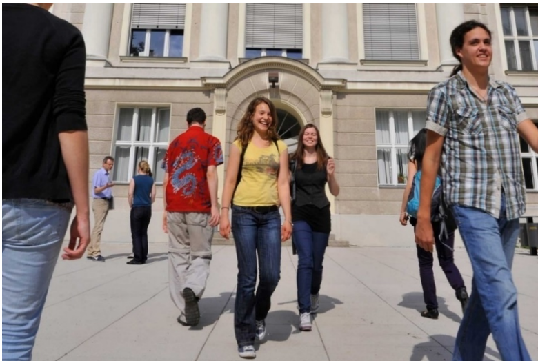
Figure 3: Happy, freewheeling, first years biochemistry students in front of Hahn-Meitner-Bau

berlin.hosted.exlibrisgroup.com/primo_library/libweb/action/search.do?&vid=FUB&