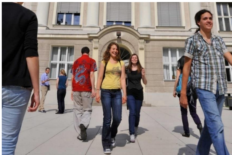
Figure 3: Happy, freewheeling, first years biochemistry students in front of Hahn-Meitner-Bau

berlin.hosted.exlibrisgroup.com/primo_library/libweb/action/search.do?&vid=FUB&