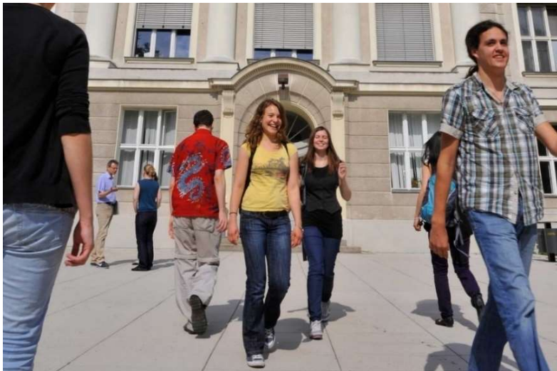
Figure 3: Happy, freewheeling, first year biochemistry students in front of Hahn-Meitner-Bau

berlin.hosted.exlibrisgroup.com/primo_library/libweb/action/search.do?&vid=FUB&