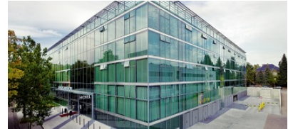
Seminaris CampusHotel Berlin Takustraße 39, 14195 Berlin